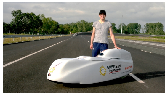
6h World record, Aldenhoven 2016