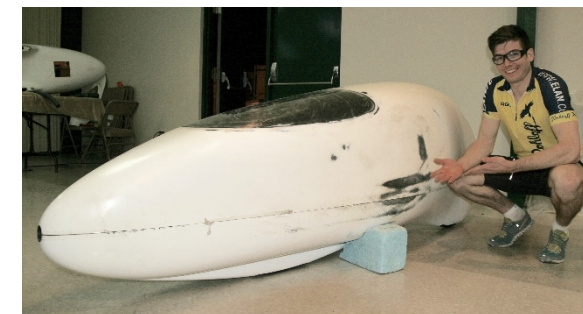
200m German record, Battle Mountain 2018