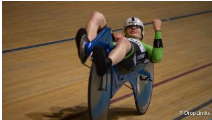
1h World record, Frankfurt-Oder 2016

German record 200 meter fullyfaired flying start (IHPVA) 127 km/h 2018