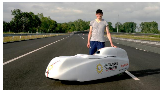
6h World record, Aldenhoven 2016