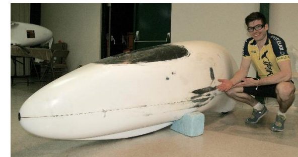
200m German record, Battle Mountain 2018